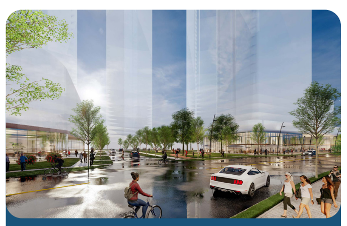
Community Living Toronto's Lawson development in Toronto will be designed to be inclusive, accessible, and transit-friendly, making it easy for everyone to get around and participate in the community.