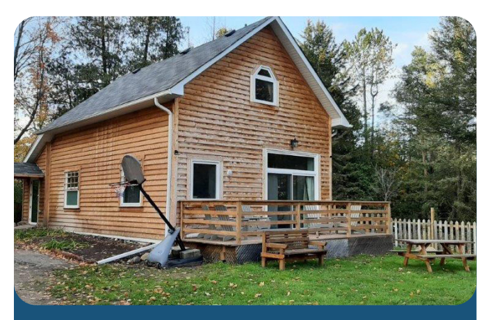
CAFFI Housing collaborated with Raising the Roof to restore a heritage building as an affordable rental, piloting an innovative home-share model.

KW Habilitation modular structure built for 2 adults. So many possibilities with modular structure can fit in a backyard or stacked as apartment units.