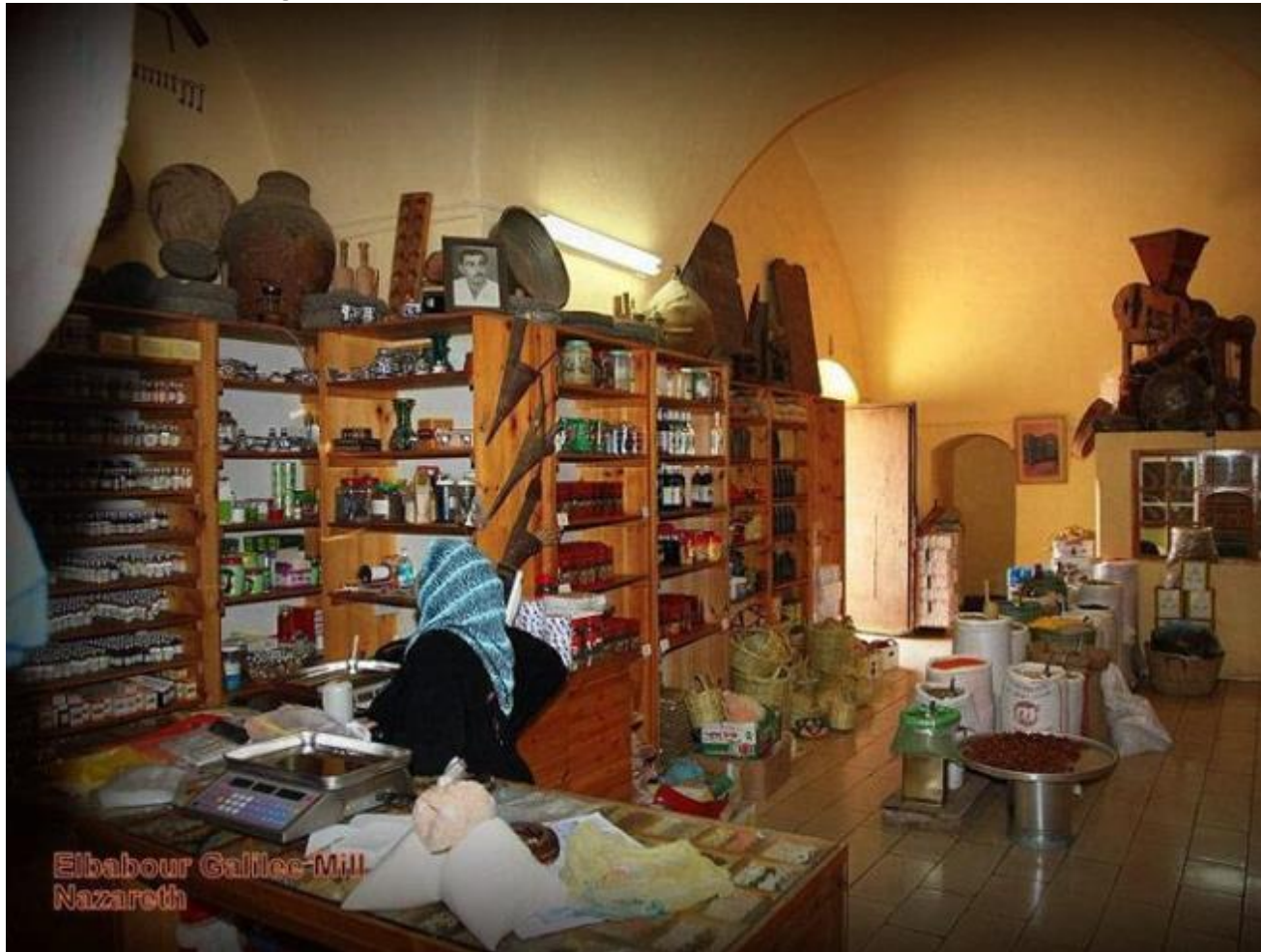
Elbabour Galilee Mill Nazareth