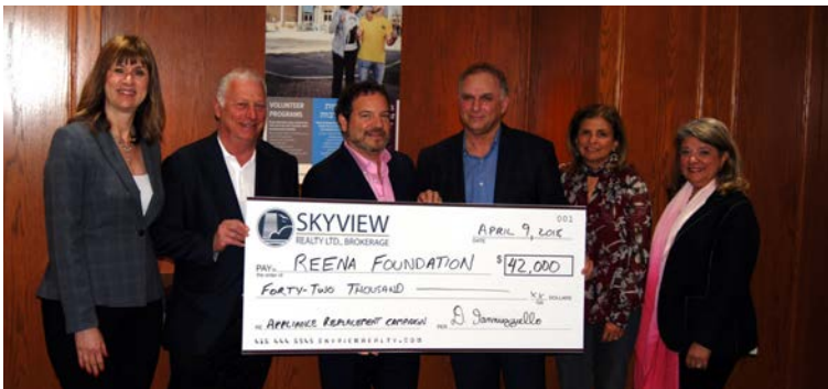
Cheque Presentation from Skyview Group of Companies and the Iannuzziello Family

Generous contributions to the Appliance Campaign, totaling $42K were made by the Skyview Group of Companies, the Iannuzziello Family and other network partners. This important practical campaign has allowed Reena to replace refrigerators and stoves at over 30 group homes.