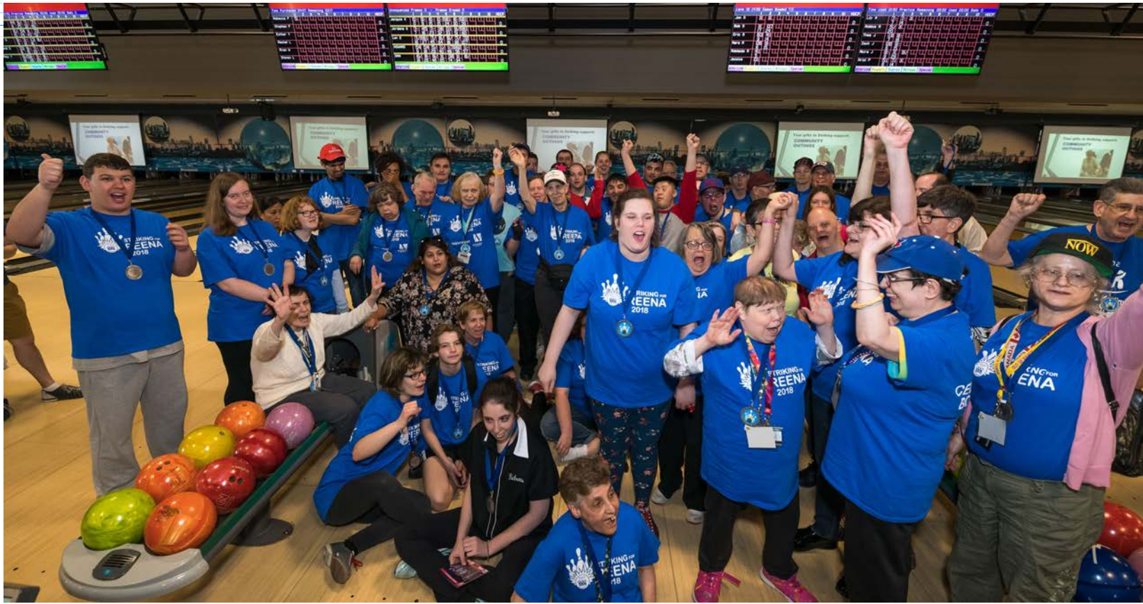
Reena Celebrity Bowlers