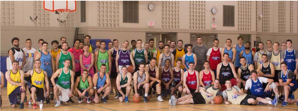
16 Competitive Teams