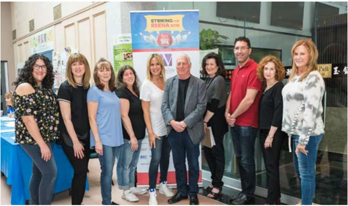
Striking Committee 2018