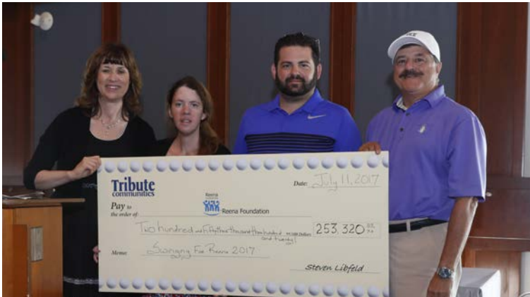
Tribute Communities cheque presentation

Proceeds have paid for a wheelchair accessible van, renovations to the Toby & Henry Battle Developmental Centre and many of our programs including technology and summer camps.