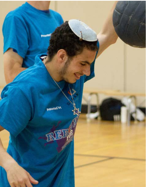
An individual supported by Reena enjoying the halftime game