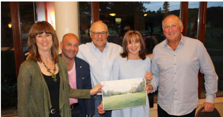
Maple Downs Pro-Am Committee Cheque Presentation

Proceeds were used to purchase a new van for the Reena Community Residence. This year's event will take place on September 6 and was sold out months in advance.