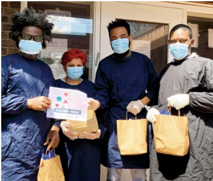
Direct Support Professionals receiving 'thank you' care packages