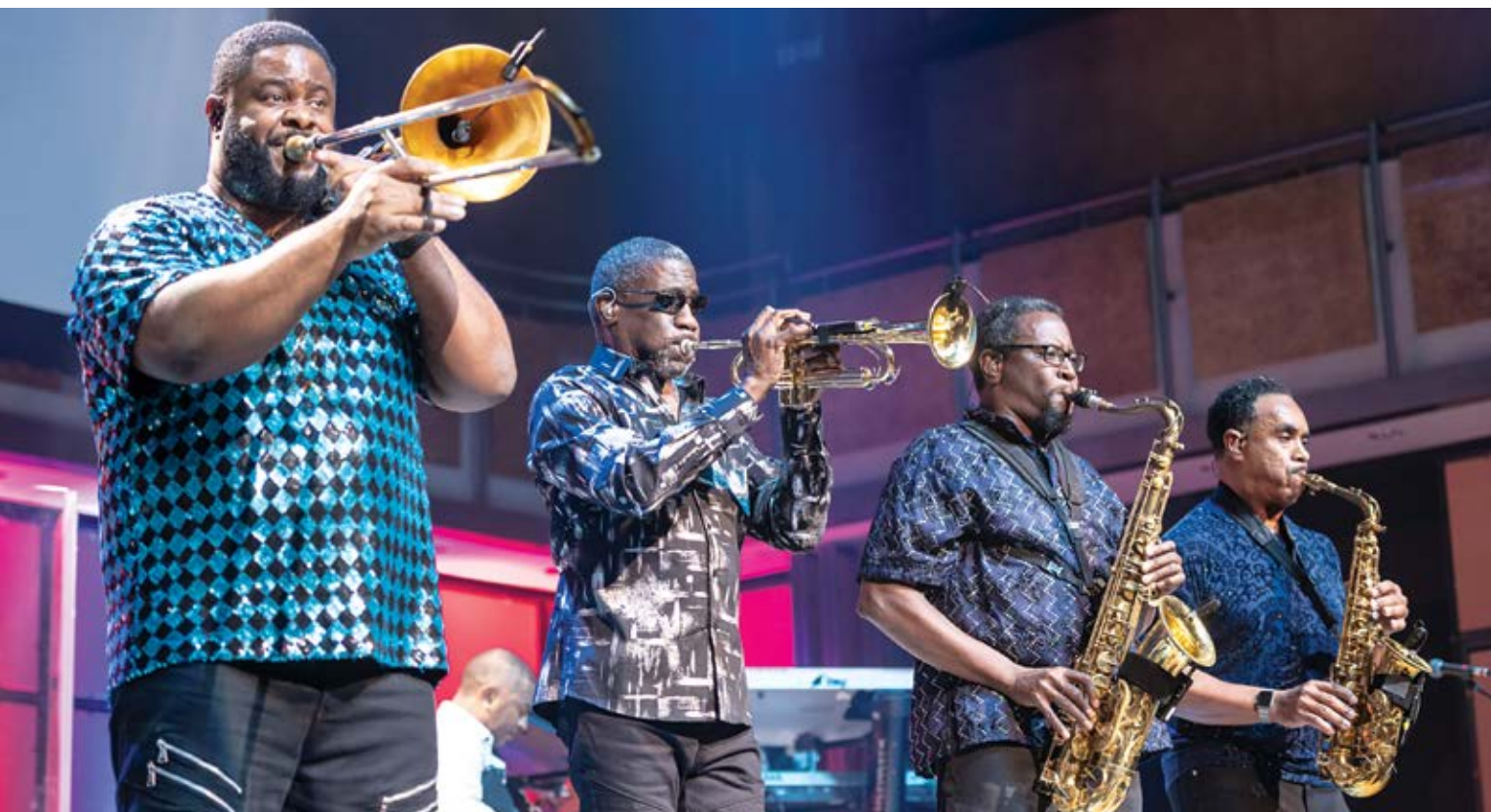
Kool & The Gang LIVE

In 1980, Kool and the Gang recorded perhaps its most iconic hit song, “Celebration”, which includes the lyrics, “It’s time to come together...”