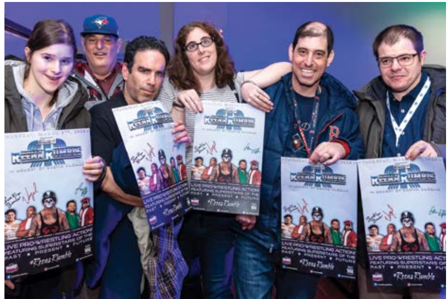
Reena VIPs meet WWE superstars

So, while those in attendance were having a great time watching their favourite wrestlers cause havoc in the ring, they were also helping countless individuals and their families deal with the challenges caused by the sudden onset of COVID-19.