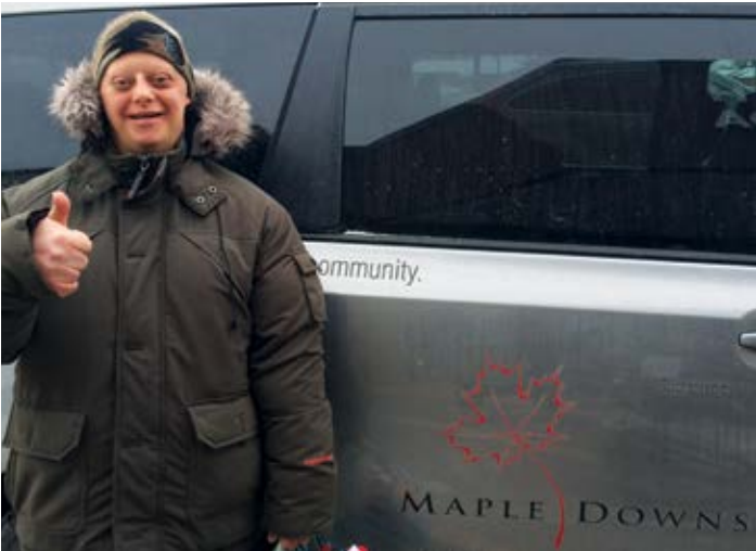
Maple Downs van at the RCR

The 2017 tournament allowed for the purchase of a van for the Reena Community Residence (RCR). Proceeds from the 2018 and 2019 tournaments have been directed to the Lou Fruitman Reena Residence, and towards the installation of a pergola at the