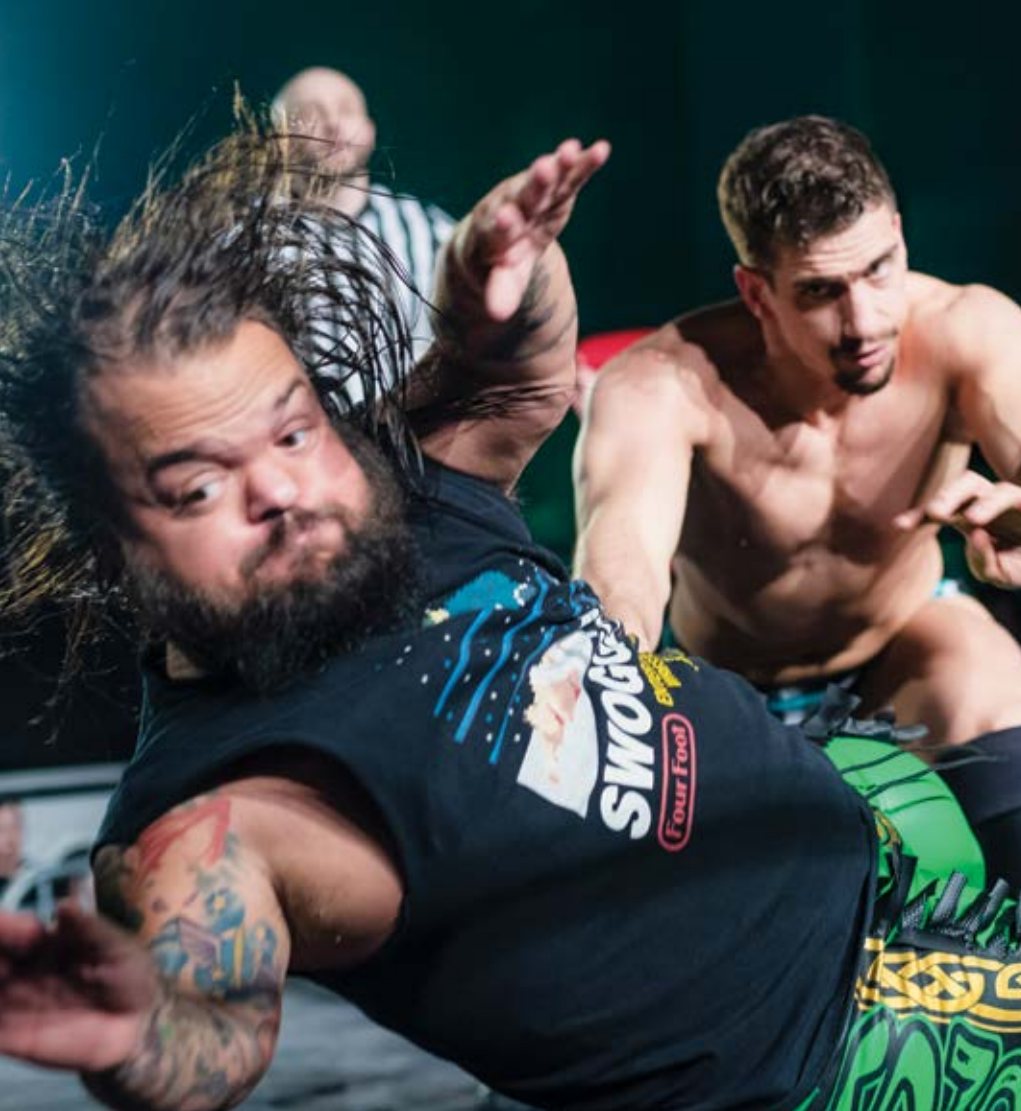
Hornswoggle returns to the ring