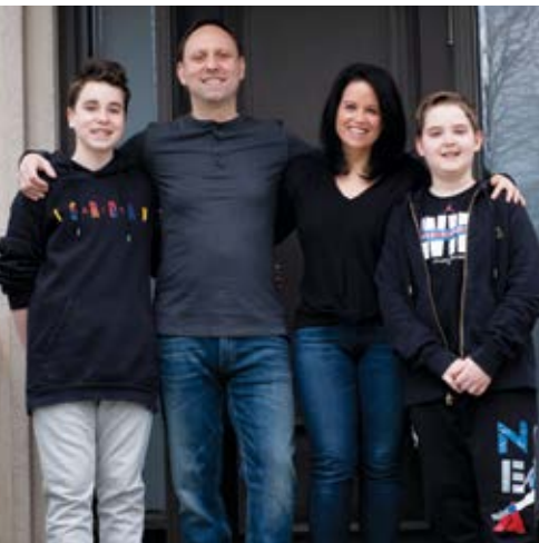
The Somer Family