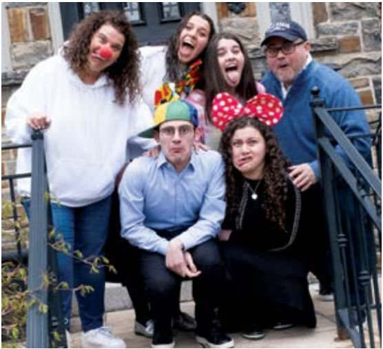
The Charlat Family