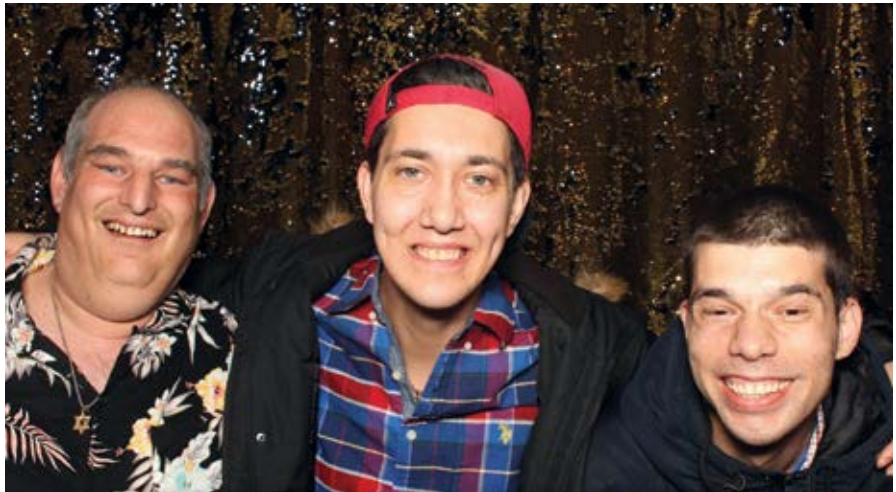
Forever Disco VIPs