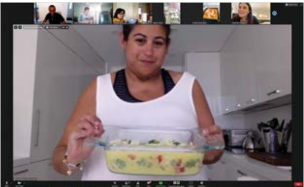
Staying connected – Virtually

RCR. The pergola has been made possible due to a generous grant from the Ontario Trillium Foundation.